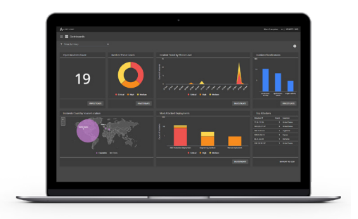
Alert Logic Console Dashboard

Our platform delivers real-time reporting, giving you access to information on risk, vulnerabilities, remediation activities, configuration exposures, and compliance status. With this intelligence, you can focus on a prioritized order of threats that need further triage, drill down into threats to act on or mitigate exposure, and provide intuitive risk visualization.